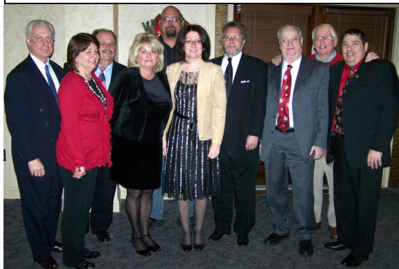
2011 Aston Business Association Board Members

This month's meeting will be held Monday, February 13, 2012, at Neumann University, in the Miranda Center. The meeting will start at 12:00 pm and the cost will be $15.00 per person. The meeting will feature lunch and a presentation on tax code changes by a member of the Neumann University faculty. Please come out for this wonderful informational event.